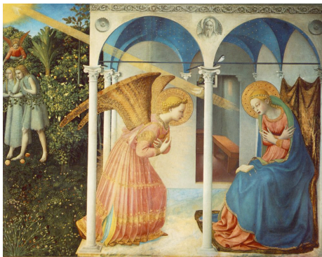
The Annunciation, fresco by Fra Angelico, 1438–45

Angelico reportedly made what was considered a profound stewardship declaration during his life: “He who does Christ’s work must stay with Christ always.”