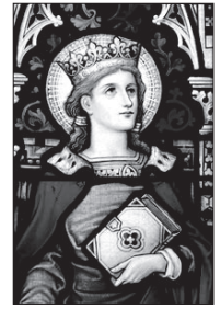
St. Margaret of Scotland, pray for us! November 16