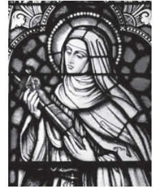
St. Rita of Cascia, pray for us! May 22