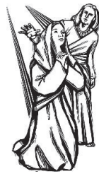
Feast of the Annunciation March 25