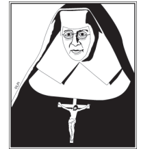
St. Katherine Drexel, pray for us! March 3