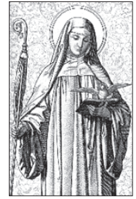
Saint Scholastica, pray for us! February 10